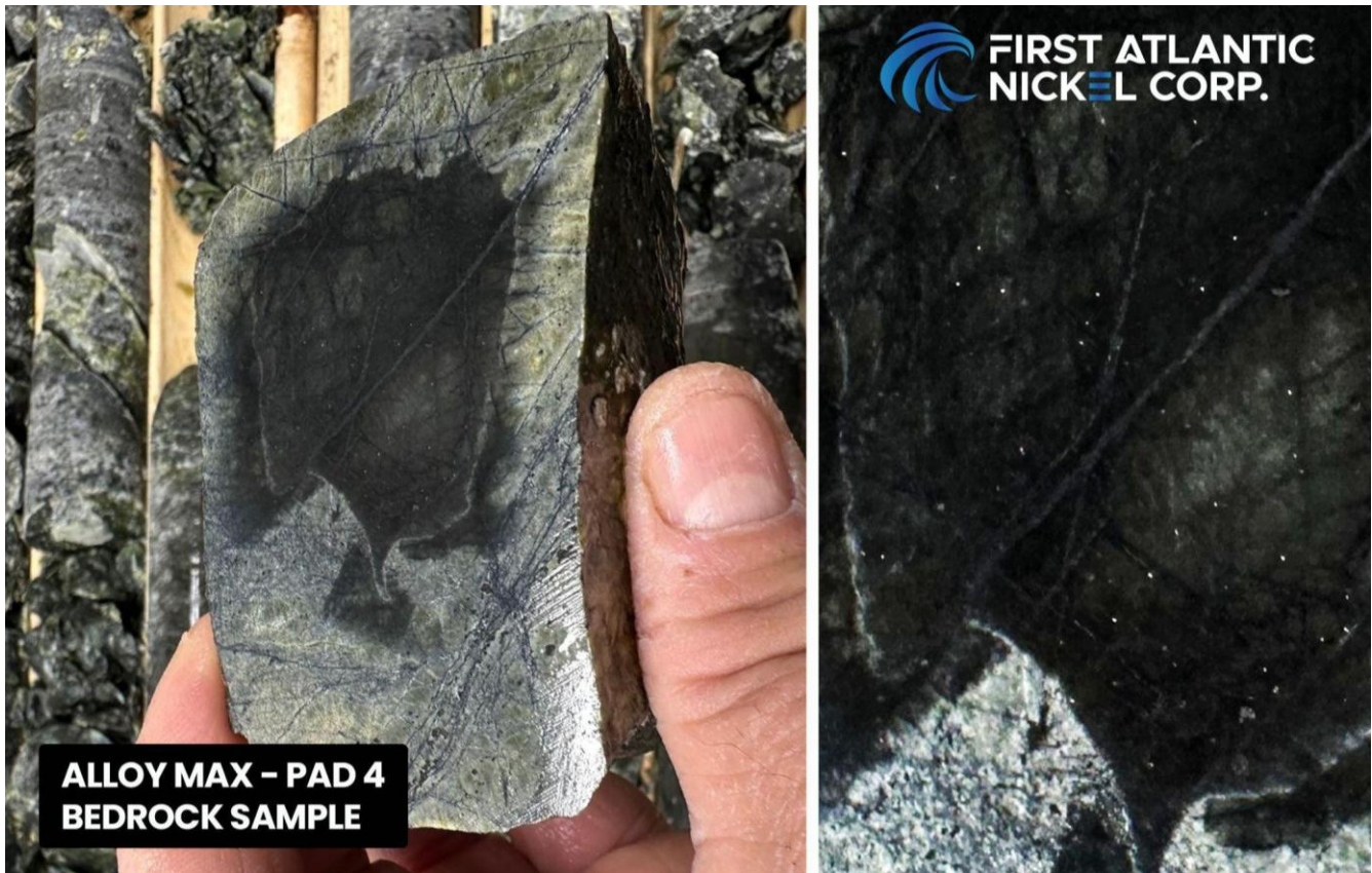
Figure 01: Bedrock sample collected beneath shallow overburden at a drill pad location. The sample confirms the drill target prior to drilling and contains visible disseminated awaruite magnetic nickel cobalt alloy mineralization.

During site preparation at the drill pad locations, minimal overburden allowed geologists to directly examine and sample bedrock, where visibly disseminated awaruite was encountered at various pad sites. This observation further supports the presence of awaruite nickel-cobalt alloy mineralization at surface across the Alloy Max target area and is consistent with the surface sampling results reported on March 18, 2026.