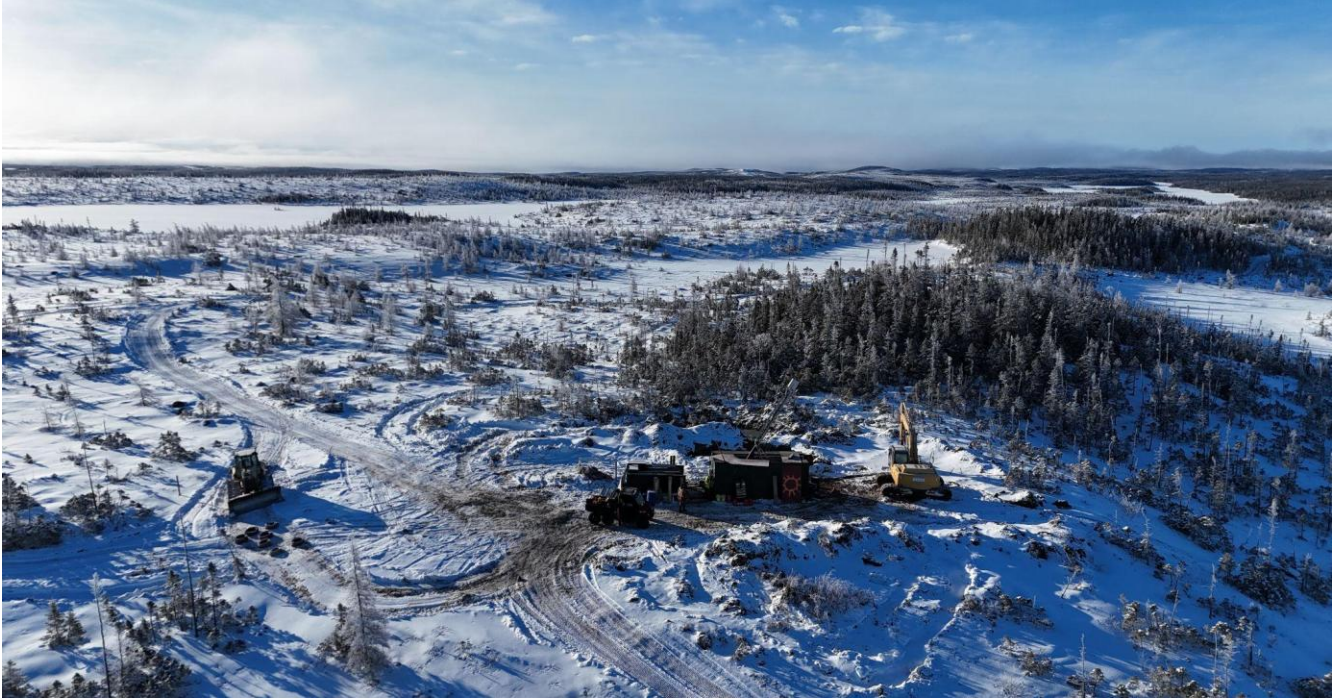
Figure 03: Drilling underway at the Alloy Max Zone, testing newly defined targets within the 4 km by 1.2 km wide target area 7 km north of RPM Zone discovery.