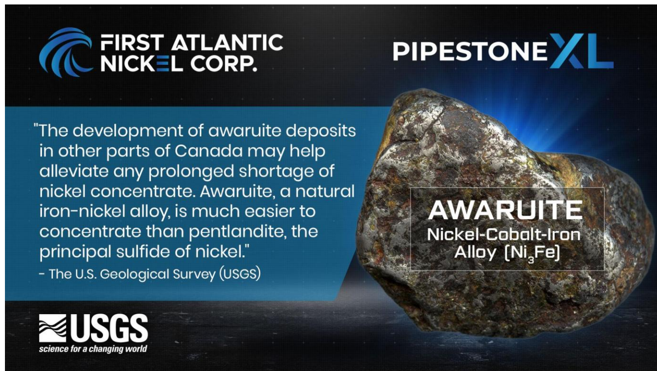
Figure 2: United States Geological Survey (USGS) quote on awaruite nickel-iron-cobalt alloy deposits.

The sulfur-free nature of awaruite (Ni 3 Fe), a naturally occurring nickel-iron-cobalt alloy already in metallic form, eliminates the need for secondary processes such as smelting, roasting or acid leaching that are typical of sulfide or laterite nickel ores. Unlike sulfides, which are not natural alloys, awaruite avoids the challenge of sourcing smelter capacity, a bottleneck in North America's nickel supply chain. With an average nickel grade of approximately 75%, awaruite significantly exceeds the ~25% nickel grade characteristic of pentlandite. Awaruite's strong magnetic properties enable concentration through magnetic separation, as demonstrated by Davis Tube Recovery (DTR) testing at First Atlantic's RPM Zone drill core.