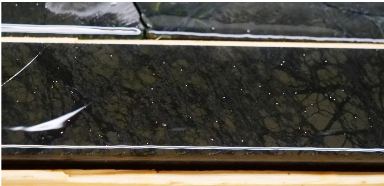
Figure 3: Example photograph of large grain awaruite ( \text{Ni}_3\text{Fe} Nickel-Iron-Cobalt Alloy) visible in drill core from the RPM Zone at the Pipestone XL Nickel Alloy Project.