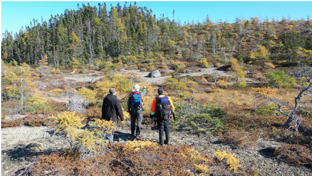
Figure 2: Standing in a portion of the RPM Zone, with typical dry mound-type topography lacking vegetation due to high magnesium content in underlying ultramafic rocks.