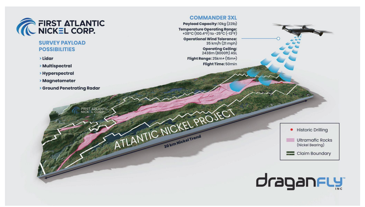
Figure 1: Atlantic Nickel Project area with unique awaruite nickel-alloy host rocks to be surveyed by Draganfly drone technology.