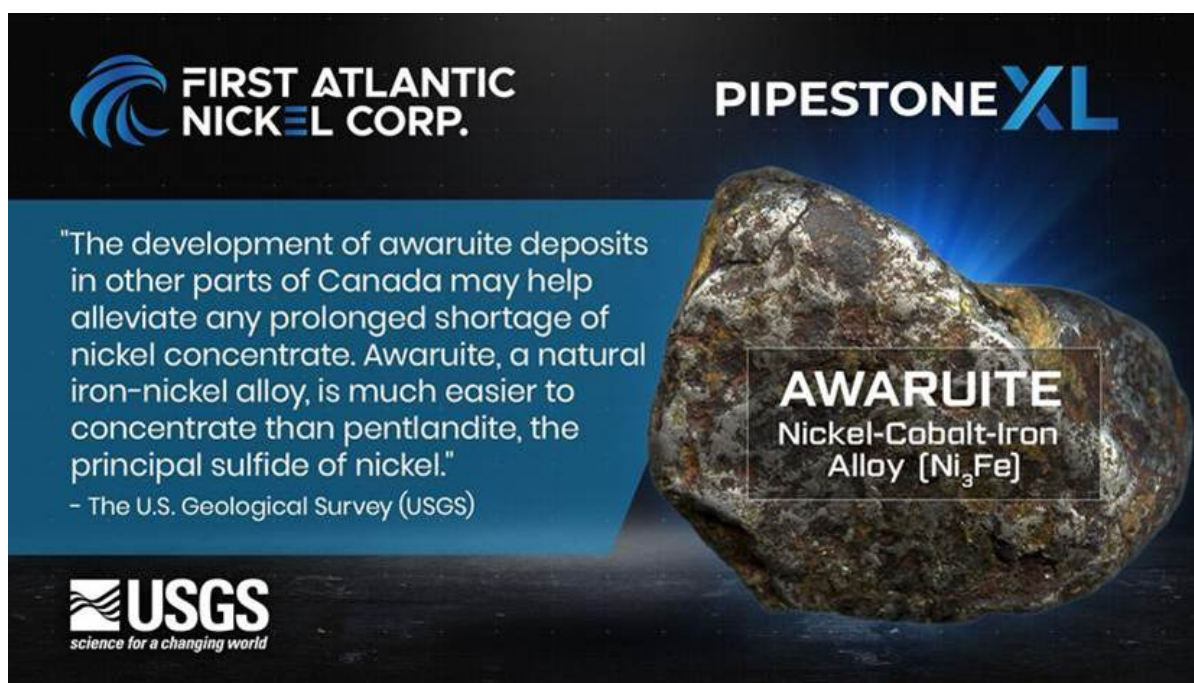
Figure 2: Quote from USGS on Awaruite Deposits [2]

The U.S. Geological Survey recognized awaruite's strategic importance in its 2012 Annual Report on Nickel, noting that these deposits may help alleviate prolonged nickel concentrate shortages since the natural alloy is much easier to concentrate than typical nickel sulfides. The Pipestone XL Nickel-Cobalt Alloy Project is located near existing infrastructure with year-round road access and proximity to hydroelectric power. These features provide favorable logistics for exploration and future development, strengthening First Atlantic's role to establish a secure and reliable source of North American nickel production for the stainless steel, electric vehicle, energy storage, aerospace, and defense industries. This mission gained importance when the US added nickel to its critical minerals list in 2022, recognizing it as a non-fuel mineral essential to economic and national security with a supply chain vulnerable to disruption.